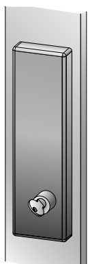
Manual locking / unlocking via key or rotarytype knob from inside and/or outside