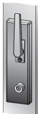
Option: Manual unlocking device for SLX Break-Out, inside