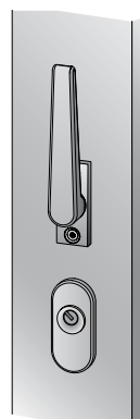
Option: Manual unlocking device for PSW <green wings> (completely integrated in the profile), inside